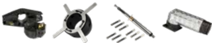
Tooling (from p. 32) Special tool for elbow beveling XL extension for ID 25 - 152 mm Angle motor