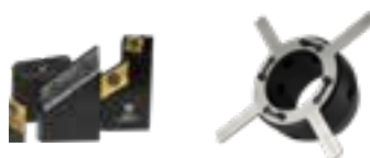
Tooling (from p. 32) Special tool for elbow beveling